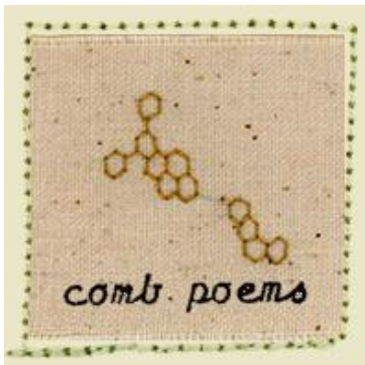
Comb Poems edition of 11 (1999)

The seven items in the Jen Bervin Early Collection are individually wrapped in cotton enclosures and housed in an archival box measuring 13 x 10 x 3 inches.