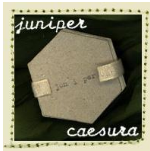
Juniper Caesura edition of 30 (1999; 2003)