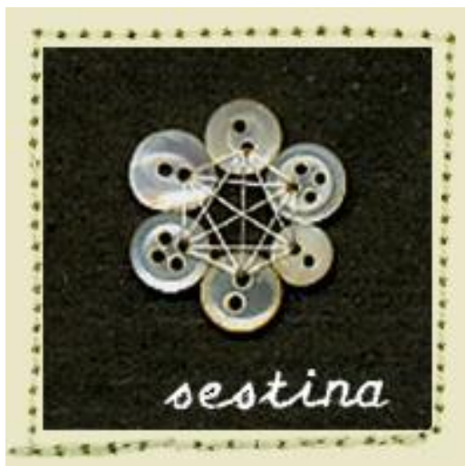
Sestina edition of 30 (2001; 2003)