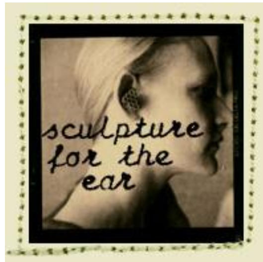
Sculpture for the Ear edition of ca. 15 (2000)