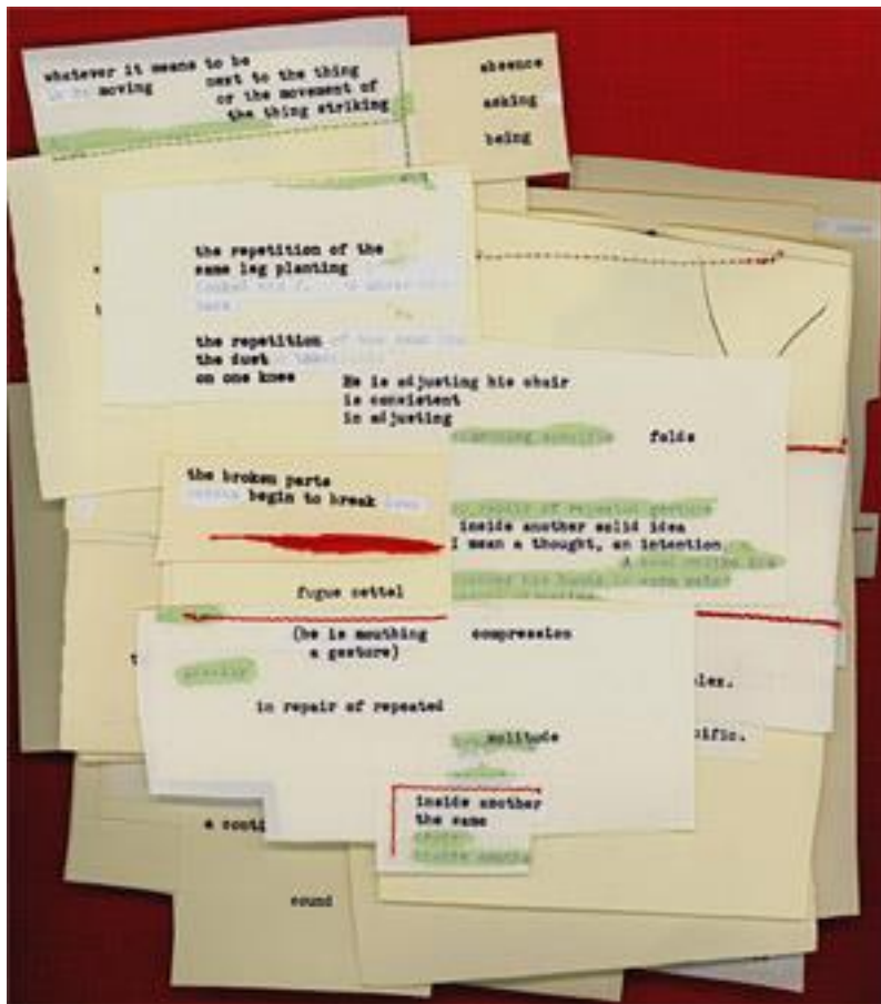
The Red Box edition of 10 (2004)